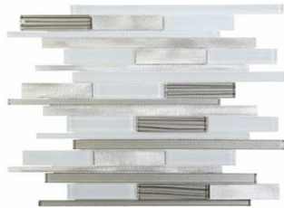
Almix White (CT101)