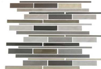
Almix Grey (CT102)