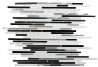
Almix White/Black (XTX19)