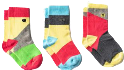
Blocks of Colour