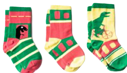
The Green Dinosaur