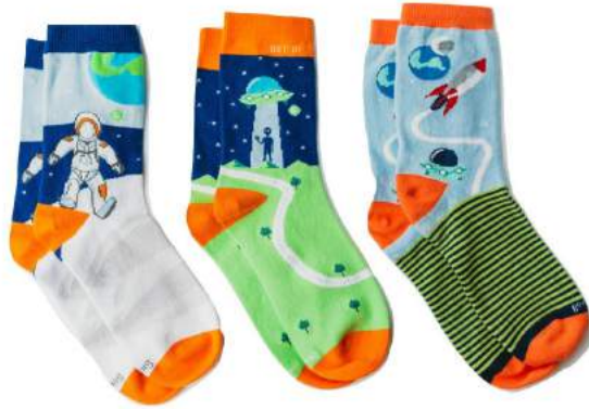
Out of This World