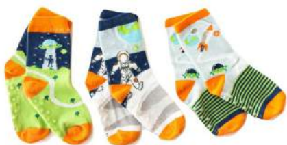
Out of This World