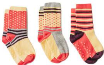
Types of Stripes