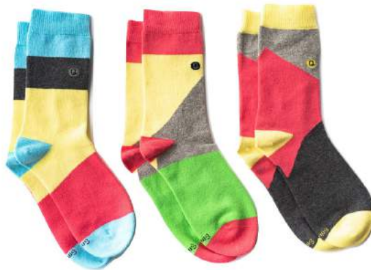
Blocks of Colour