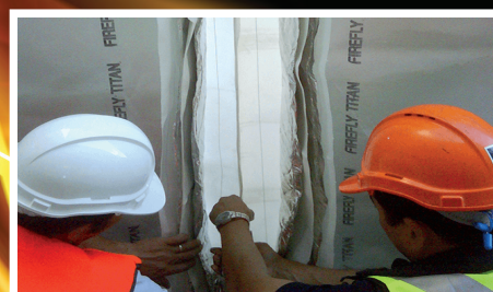
Titan Vertical Seam