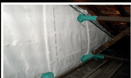
Strata Unit Subdivision NSW