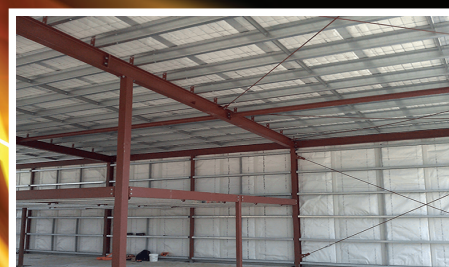
SES Building 2012 NSW