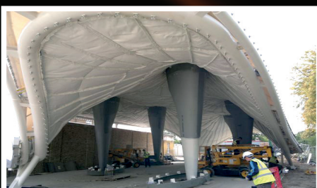
Bespoke Application Fire Protection Serpentine Sackler Gallery UK