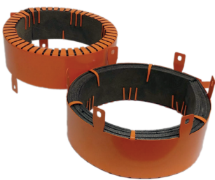
FRF 150 Fire Collars