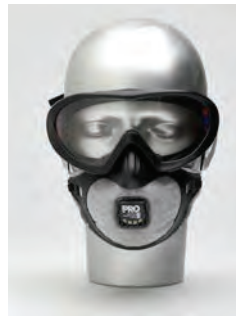
Goggle and Respirator Combo