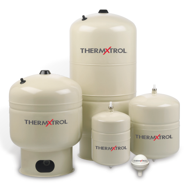
See the full line of Therm-X-Trol® Tanks at amtrol.com