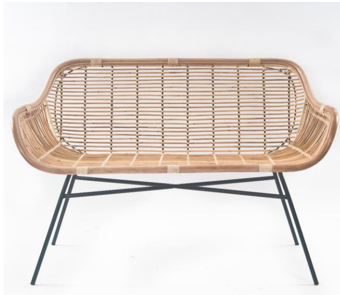
Chair Fully Assembled