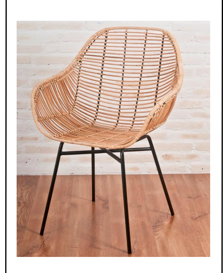
Chair Fully Assembled