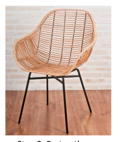
Step 3: Fasten the washer and metal nut onto each bolt securely. Use a spanner to tighten.