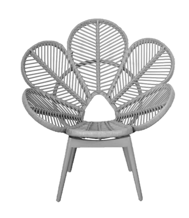
Chair Fully Assembled