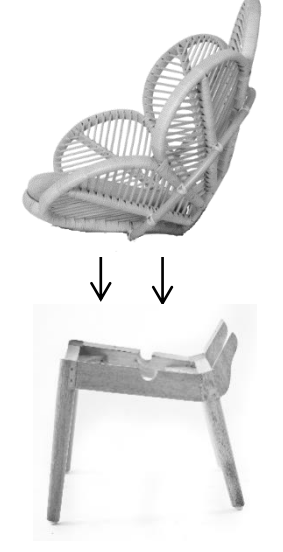
Step 2: Align seat with pre cut grooves on Legs