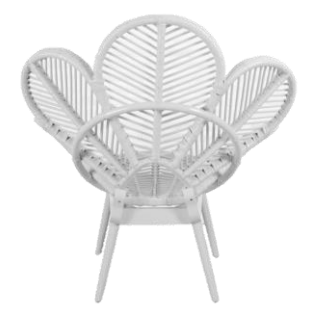
Step 4: Screw in 2 short sharp screw in pre drilled holes behind the legs