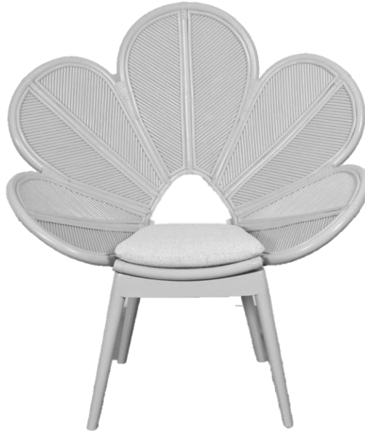
Chair Fully Assembled