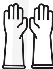
CURRENT TILSATEC PULSE™ SIZE RANGE

Use the conversion table below to find out the recommended size for use.