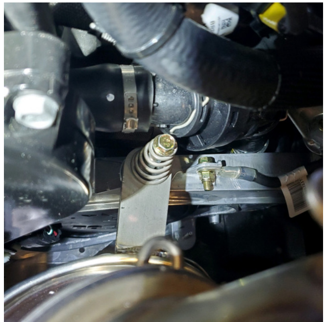
4. Remove 10mm bolt from backside of muffler then remove the muffler.