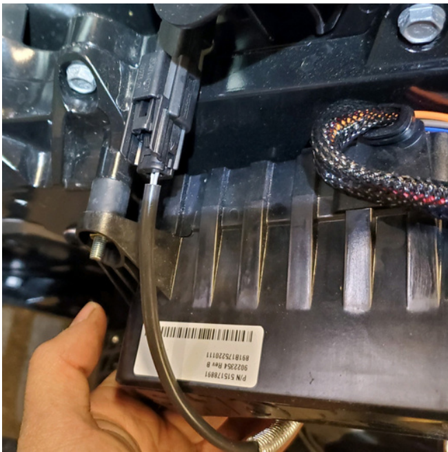
3. Unplug EGT sensor.