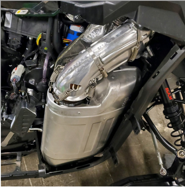
1. Remove body panel and heat shields.