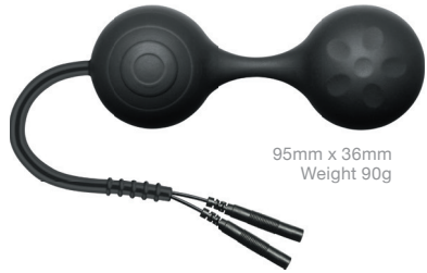
95mm x 36mm Weight 90g

Designed especially for her, Nona is worn inside the vagina and nuzzles her G-spot with its curvaceous form. Sit upright or on all fours and rock against the curve for an explosive orgasmic experience. Bi-polar, safe for vaginal and anal use.