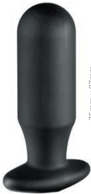
75mm x 27mm

Lose yourself to the pleasure of a more sensual erotic electro-stimulation experience. The ElectraStim Silicone Noir range of electro sex toys is made from 100% silicone for a softer and more squeezable texture that complements the throbbing and pulsating sensations of EES.