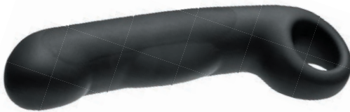
125mm x 38mm

Part jiggle ball, part muscle toner; Lula features a free-roaming weight that massages her G-spot and bi-polar conductive contacts to help her indulge in delicious internal sensations..