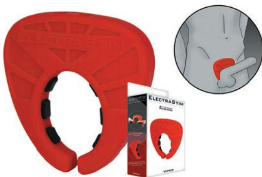
78mm x 76mm (orifice 30mm, expandable to 60mm)

Viper is a bipolar electro sex cock shield designed to be worn either during masturbation or sex with a partner. Made from the signature black and red silicone of the Silicone Fusion range,