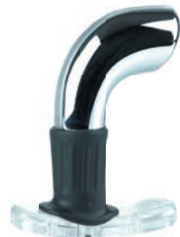
- with Focus Sleeve installed -

Weight: 260g with Focus Sleeve, 256g without