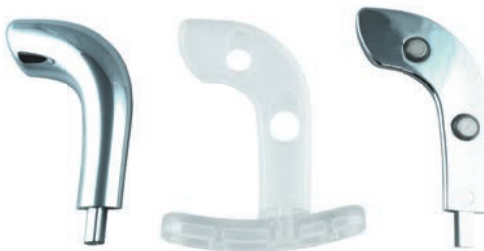
- Rogue disassembled for cleaning -

Contents: Rogue Prostate Massager (assembled), silicone 'Focus Sleeve', drawstring storage bag.