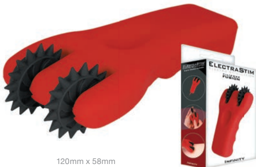
120mm x 58mm

A first for the electro category, Infinity is inspired by the classic Warternberg pinwheel but with a twist. The smooth and slightly flexible silicone lends a softer appearance to the toy while the feel-it-to-believe-it performance of the electro stimulation ensures the intense sensations you'd expect.