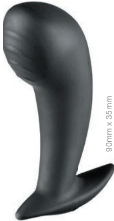
90mm x 35mm

Ideal for beginners and suitable for both vaginal and anal use, the Aura multi-probe has bi-polar contacts and is perfectly proportioned to massage her G-spot or his prostate during wear.