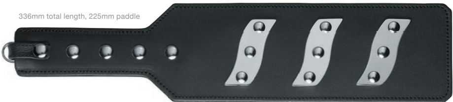
336mm total length, 225mm paddle

From soft and sensual to deeply sadistic, our fetish play electrodes are designed to push your pleasure/pain boundaries one level at a time. Use them alongside an intimate electrode or combine any two to test your kinky limits.