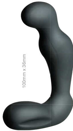
100mm x 36mm

Smooth, seductive and satisfying, Ovid combines a full tip and a swollen bump in the shaft to intensify the pleasure experienced with every thrust. Suitable for both vaginal and anal use, this bi-polar dildo is perfect for G-spot and prostate stimulation.