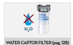
WATER CAPTOR FILTER (pag. 128)