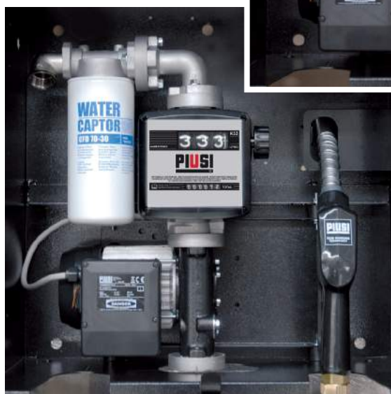
ST BOX BASIC