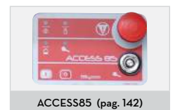
ACCESS85 (pag. 142)