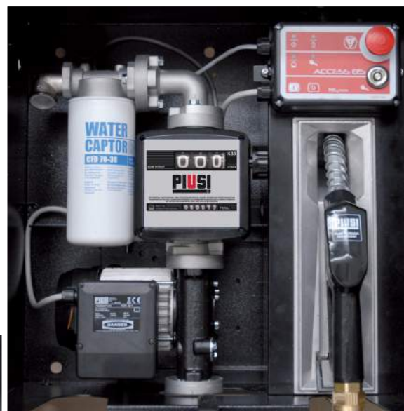
ST BOX PRO