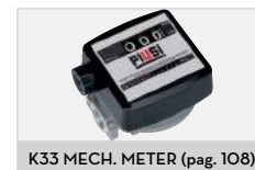
K33 MECH. METER (pag. 108)