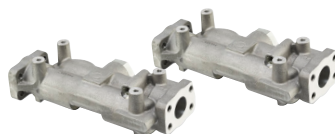
CFLS Dual Filter Heads P568583, P574958