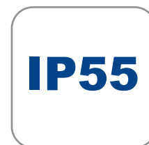
motore - engine