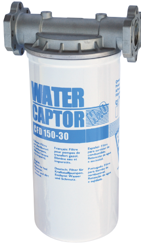
150 L/MIN WATER CAPTOR WITH WATER ABSORPTION