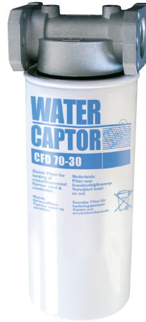
70 L/MIN WATER CAPTOR WITH WATER ABSORPTION