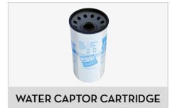
WATER CAPTOR CARTRIDGE