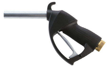
SELF 3000 DIESEL/GASOLINE