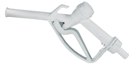
PLASTIC NOZZLE WATER/FOOD