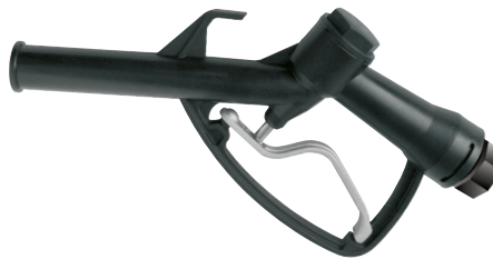
PLASTIC NOZZLE WATER/DIESEL