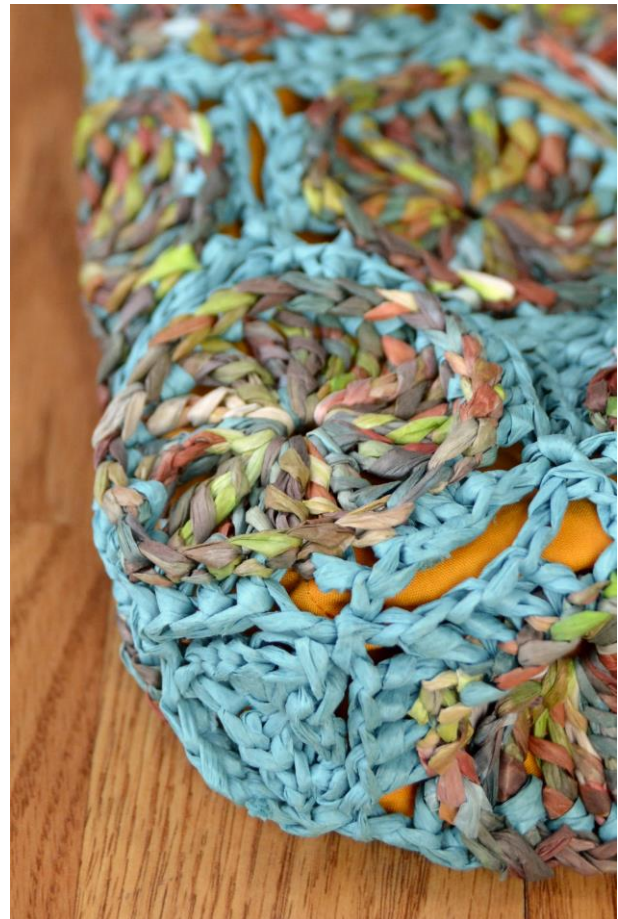
Triangle Motif Filler detail