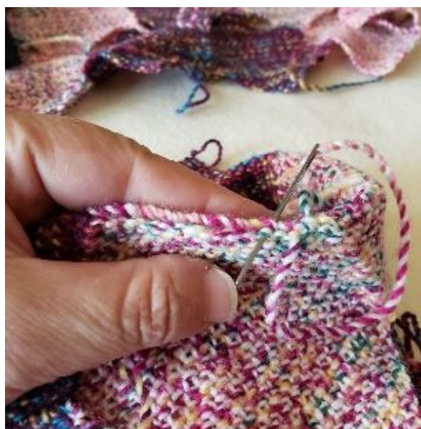
Steps 2 & 3: Sew Hexagons together using whipstitch.