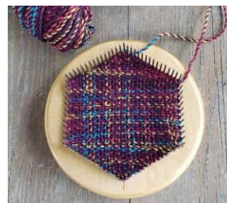
Hexagon Pin Loom

NOTE: Please contact gabi@texasgabi.com for pattern support.