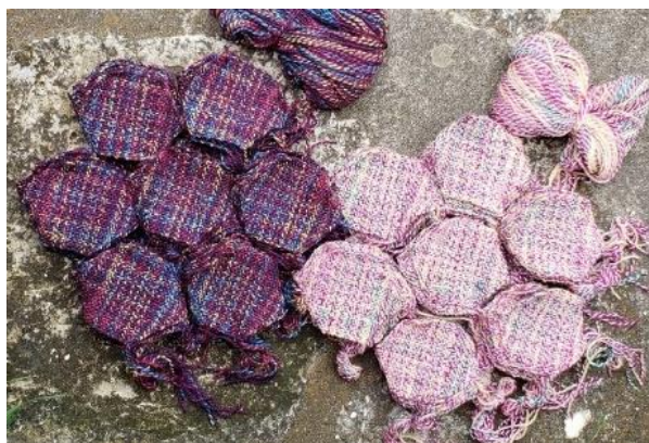
68 Hexagons in 103 Mardi Gras; 70 Hexagons in 104 Tulip

Leave the tails for sewing the hexagons together (recommended) or sew them in at this point if you wish to use separate yarn for the assembly.