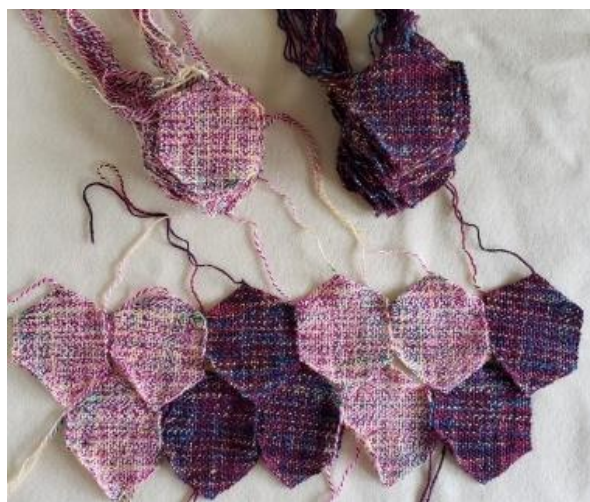
Step 1: Laying out the hexagons according to the diagram.