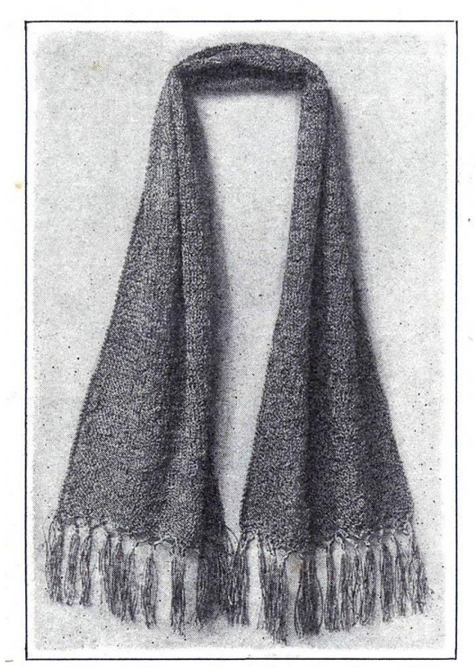
A Knitted Motor Scarf for the Man With an Automobile