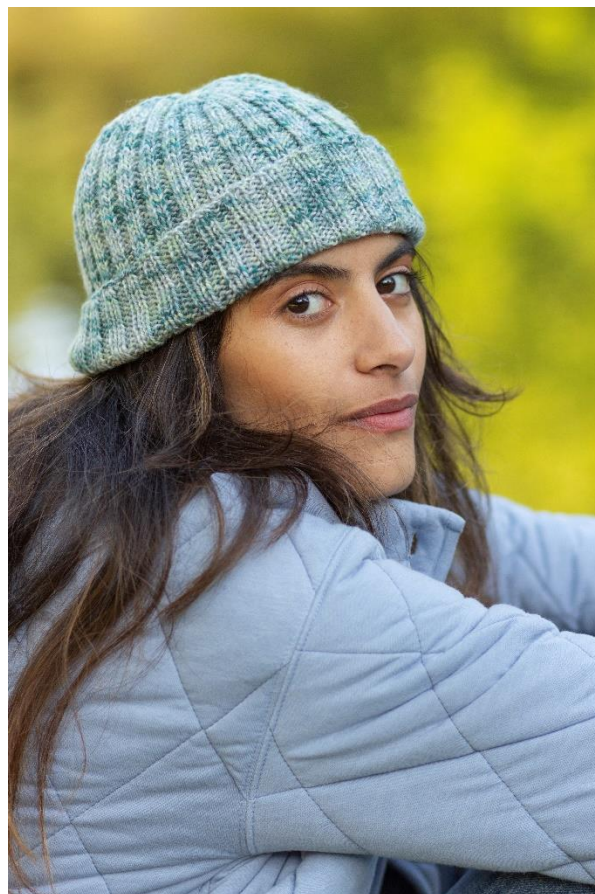
Version 2 - 106 Meadow

Rnd 10: * K2tog, p2tog, k2tog, p2tog; rep from * to end – 20 (24, 28, 32, 36) sts dec'd, 20 (24, 28, 32, 36) sts rem.