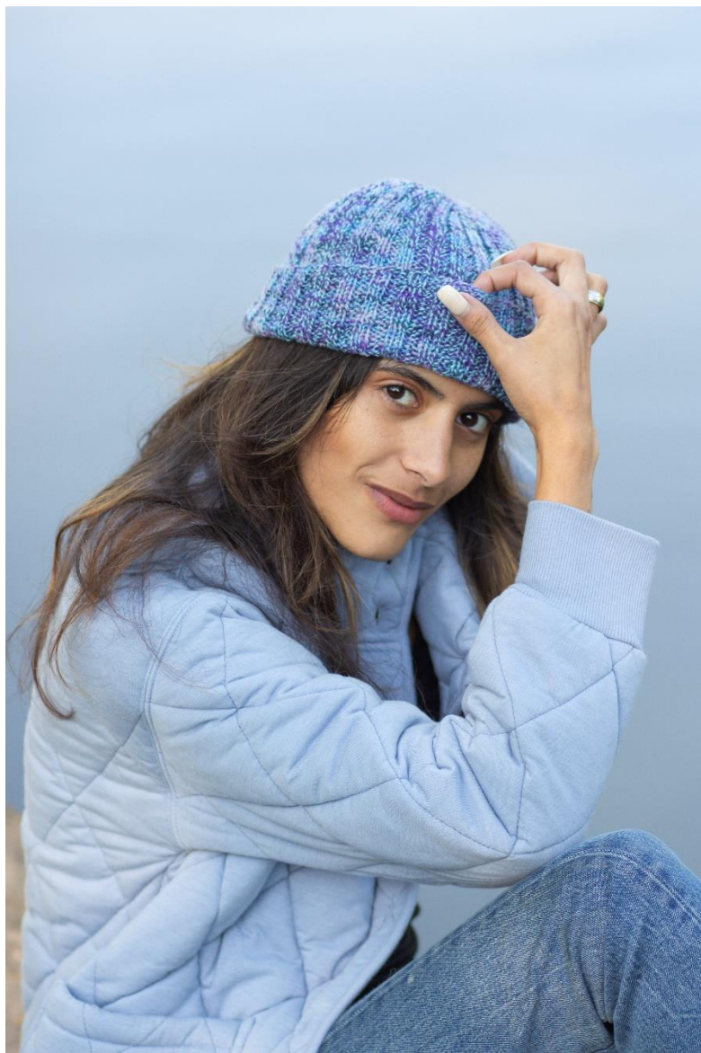
Version 1 - 102 Precious Jewels