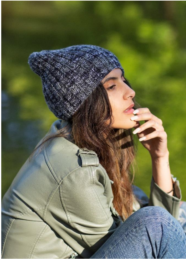
Version 3 - 108 Tuxedo