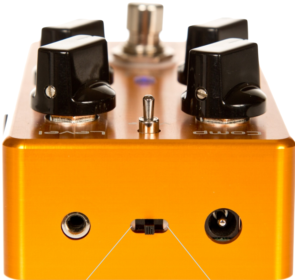
FX Link Switch Position