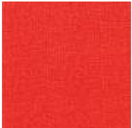
15 X 21 Red-1 (R1)