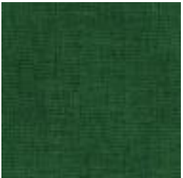
15 x 21 Green-1 (G1)