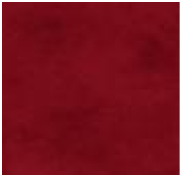
9 x 10.5 Red-2 (R2)