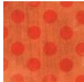
Light Red 18X 21