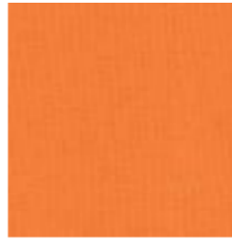
Medium Red 9 X 21