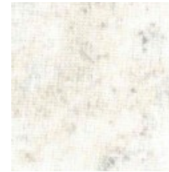
#8 7 x 42