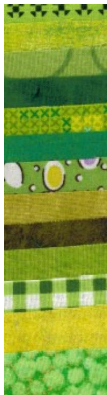
LEAVES 4 X 7