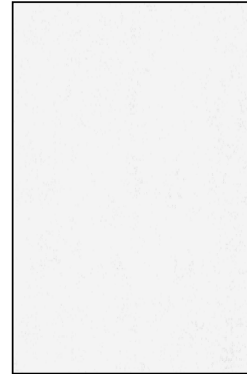
FABRIC I 18 X 42