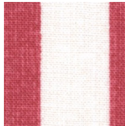
INNER BORDER & BINDING