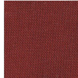
INNER BORDER & BINDING