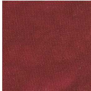
BORDER (INNER) & BINDING