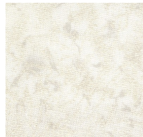
FINAL BORDER & BINDING