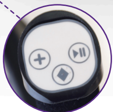
Independently-adjustable handlebars with programmable buttons