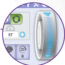
On-screen hand wheel

Twenty inches of creativity at your fingertips.