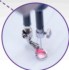
Pinpoint needle laser