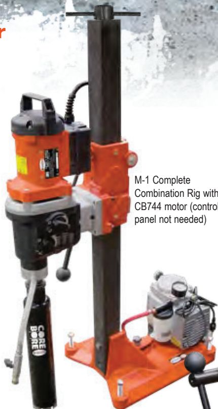
M-1 Complete Combination Rig with CB744 motor (control panel not needed)