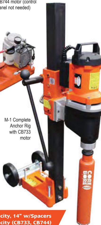
M-1 Complete Anchor Rig with CB733 motor