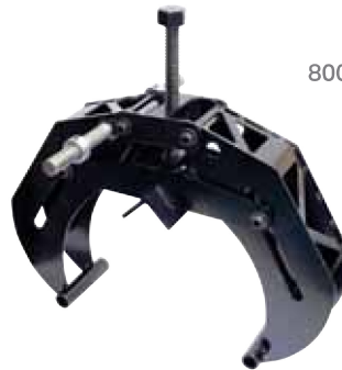
800 Series Pipe Clamp Accessory

In addition to the time saving value of PowerGrit technology, the pipe clamp accessory, designed for ICS 800 series hydraulic saws and developed for the underground pipe application, brings a whole new level of safety, accuracy and ease of use to the job. With a simple adaptor, you can mount to this clamp and dramatically reduce the effort of handling the saw, while providing a solid, stable cutting platform that further improves operator safety and precision of the cut.