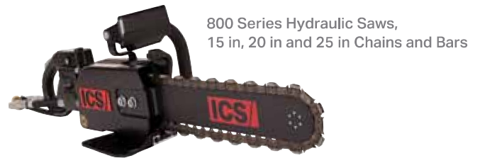
800 Series Hydraulic Saws, 15 in, 20 in and 25 in Chains and Bars