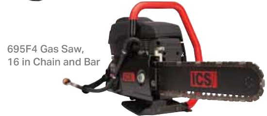
695F4 Gas Saw, 16 in Chain and Bar