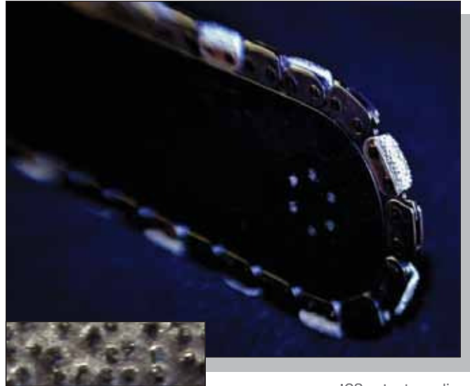
Braided Diamond Layer

* Asbestos is a hazardous material, known to cause serious respiratory diseases. Cutting into asbestos can release asbestos fibers into the air. Always research and follow the correct safety procedures, including applicable national and state or provisional occupational health and safety regulations, and protect yourself and those around you from asbestos-related disease. Always arrange for the material to be removed safely by a qualified person. ICS is not responsible for exposure to asbestos caused by use of this product.