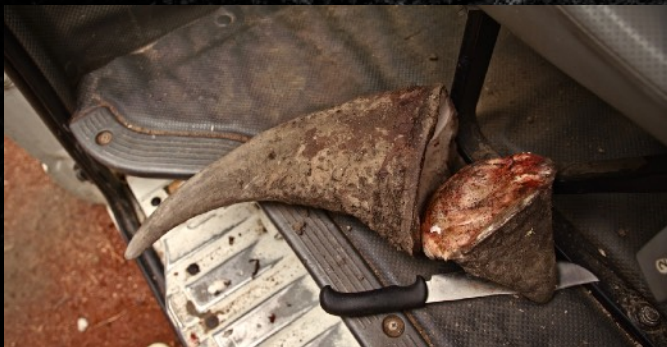
C) Prepping rhino horn for sale.