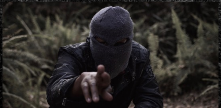
D) Interview with a leader from a poaching gang.