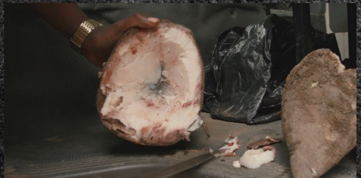
B) Rhino horn used in the covert operation.