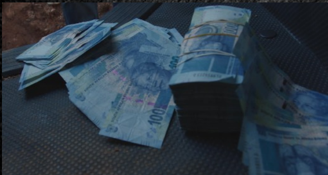
A) Money paid to the undercover agent.

The viewer also dives into the reality of the poacher's world putting them face to face with the people that pull the trigger. First hand interviews with active poachers and informants describe how, where and why they turn to rhino poaching. A member of Erebus narrates the complexities of the case they are building, all the while the evidence accumulates and then concludes in the special operation takedown of South Africa's two biggest rhino poaching kingpins.