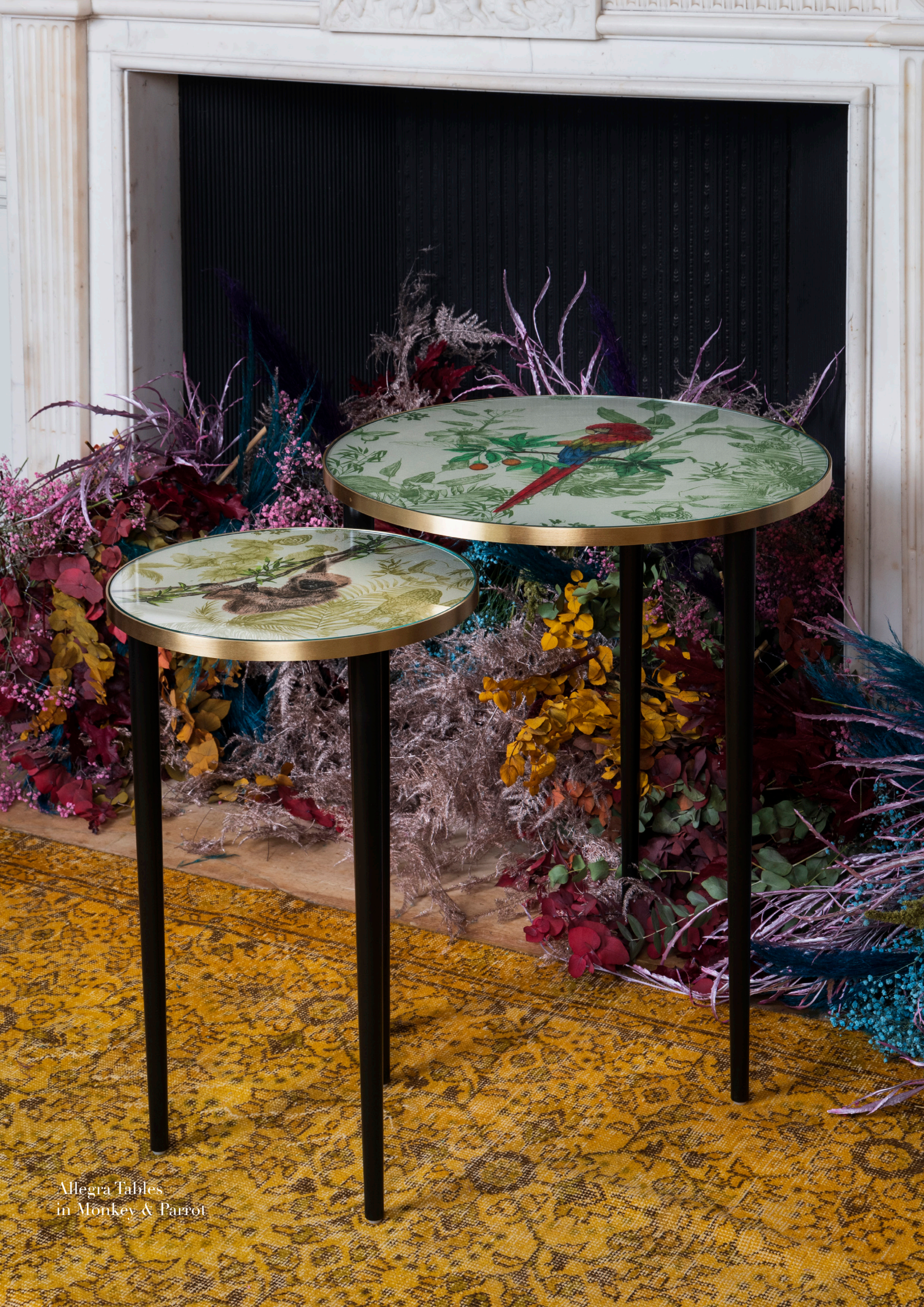
Allegra Tables in Monkey & Parrot