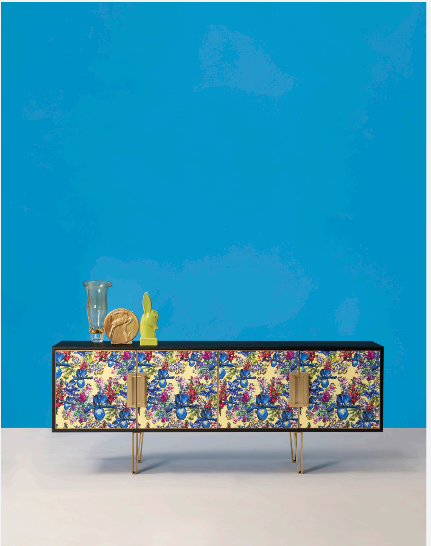
Blake Sideboard in Navarra