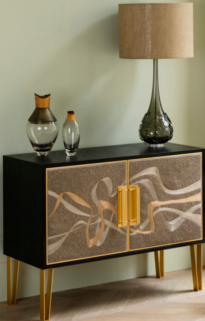
Betty Sideboard in Bronze Swirl