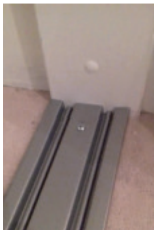
Bottom track on top of carpet butting up to strike plate