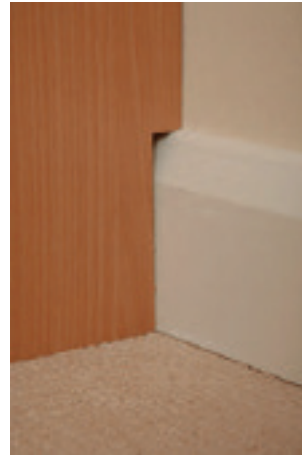
End panel square cut to fit over skirting board