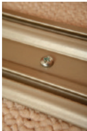
Bottom track screwed down on top of carpet