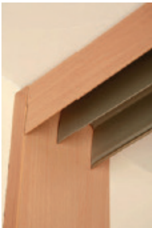
Top track butting up against a strike plate

The top track measures 81mm deep and 45mm high (Contract & Contract + range) 80mm deep and 40mm high (Premium range)