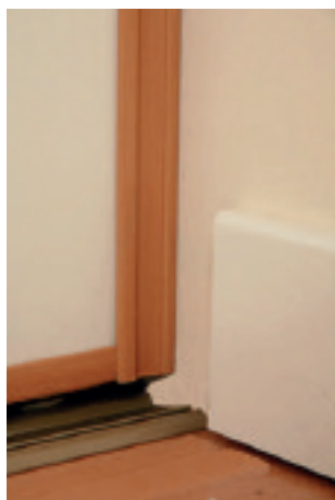
No strike plate