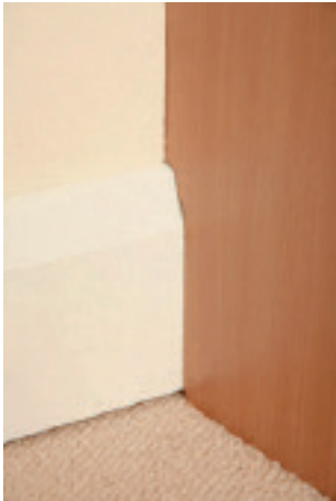
End panel scribed around skirting board

End panels are supplied in the same finishes as the strike plates and co-ordinate with the frame or the panel colours. They measure 2750mm long x 640mm wide and 18mm thick so you can cut them to the length you require on site. They are fixed with modesty/half blocks on the ceiling, wall and floor.