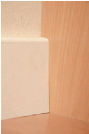
Skirting board fit up to end panel