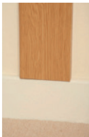
Strike plate fitted above skirting board