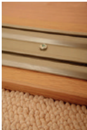
Bottom track fixed to top of strike plate with carpet butting up

The bottom track measures 87mm deep and 13mm high (Contract & Contract + range) 60mm deep and only 8mm high (Premium range). Note: The bottom tracks are to be set back from the front edge of the top track as follows 9mm (Contract & Contract + range) 14mm (Premium range) this gives an overall depth for the system of 96mm (Contract & Contract + range) or 74mm (Premium range).