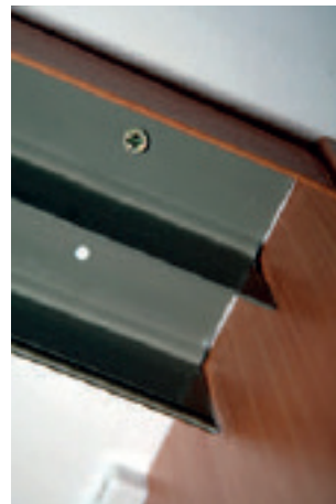
top track butting up to end panel showing ceiling fixing top track butting up to end panel showing ceiling fixing