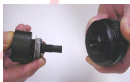
P/N 21999-0177 Moisture Minder® EDV Electronic Drain Valve

Remove float drain, apply thread sealant to 1/2" NPT threads on EDV and install to bottom cap.