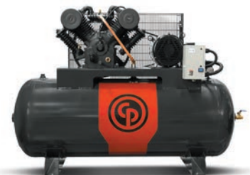
Two Stage Reciprocating Warranty - 2 Years