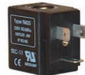
Voltage options ranging from 12 to 380VAC/DC 50/60Hz.