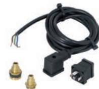
Available with power cable and adapter.

Information provided herewith is believed to be accurate and reliable. However, no responsibility is assumed for its use or for any infringement of patents or rights of others, which may result from its use. In addition, JORC reserves the right to revise information without notice and without incurring any obligation.