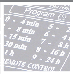
Nine pre-set programs