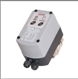
Compact modern design