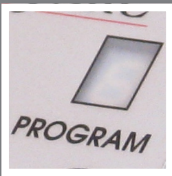
LED program indicator