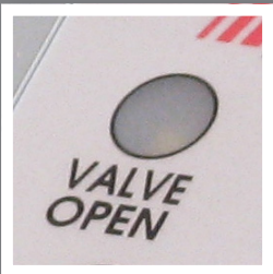
Valve open indicator