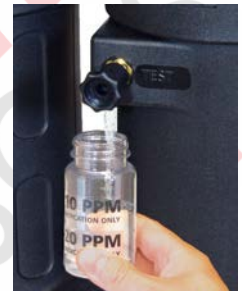
Routine testing feature incl.