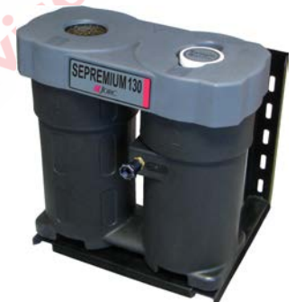
Fixing bracket available

*Avoid placing oil/water separators in direct sunlight as this might expose the unit to temperatures that could exceed maximum temperature specifications.