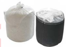
Replacement service pack