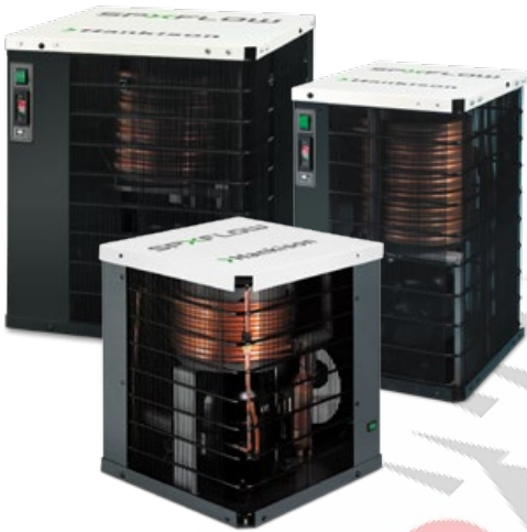
Efficient Smooth Copper Heat Exchangers

Customers around the world have relied on Hankison for great value in air treatment solutions. Hankison Value Line Refrigerated Dryers offer a simple solution based on a long history of industry leading technology.