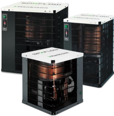
Efficient Smooth Copper Heat Exchangers

Customers around the world have relied on Hankison for great value in air treatment solutions. Hankison Value Line Refrigerated Dryers offer a simple solution based on a long history of industry leading technology.