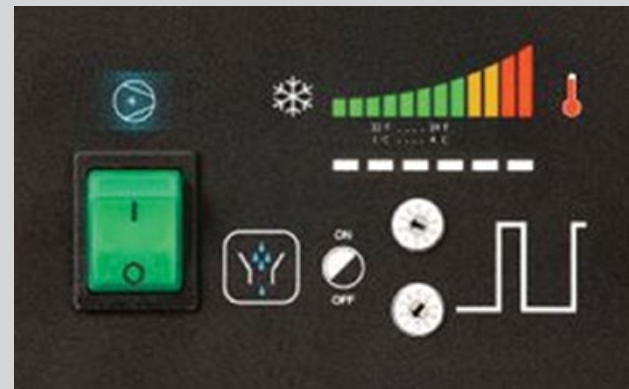
Controls: Models 200-400 scfm