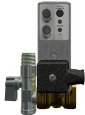
Adjustable Timed Electric Drain