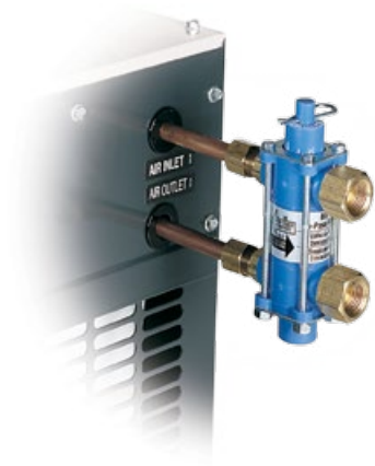
Air Bypass Valve