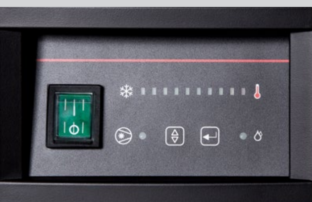
Controls: Models 200-1200 scfm