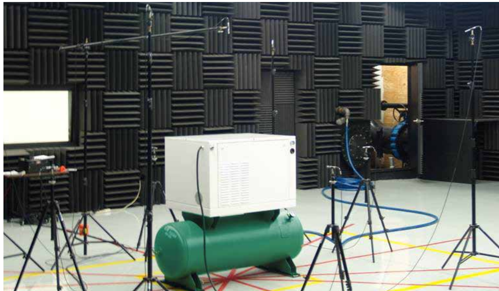
Evolution tested to CAGI adopted ISO 2151 certified standards

With a commitment to research and development, Champion provides our customers with products which uphold our tradition of quality and proven results. As part of the new product development process, the Evolution has passed extensive design reviews as well as performance, endurance and sound testing requirements.