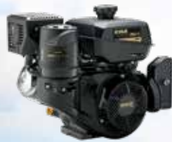
KOHLER 14 HP Command Pro CH440