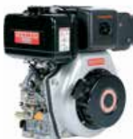
YANMAR 9.1 HP L100V