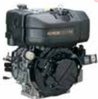
KOHLER 9.1 HP Kohler Diesel KD-440