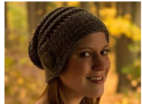
Garter stitch Brim K and P Striped body

For more patterns and video tutorials, go to www.cindwoodlooms.com