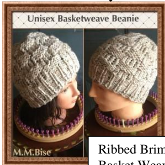
Ribbed Brim Basket Weave Body

P4 K4 all the way around the loom 4 rows