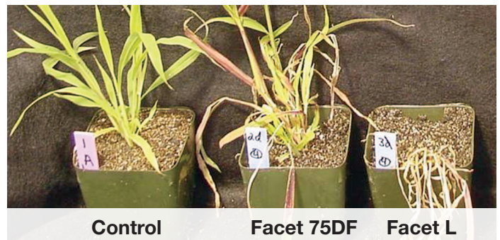
Facet L provides greater activity over Facet DF on grasses like large crabgrass (BASF internal trial 2005)